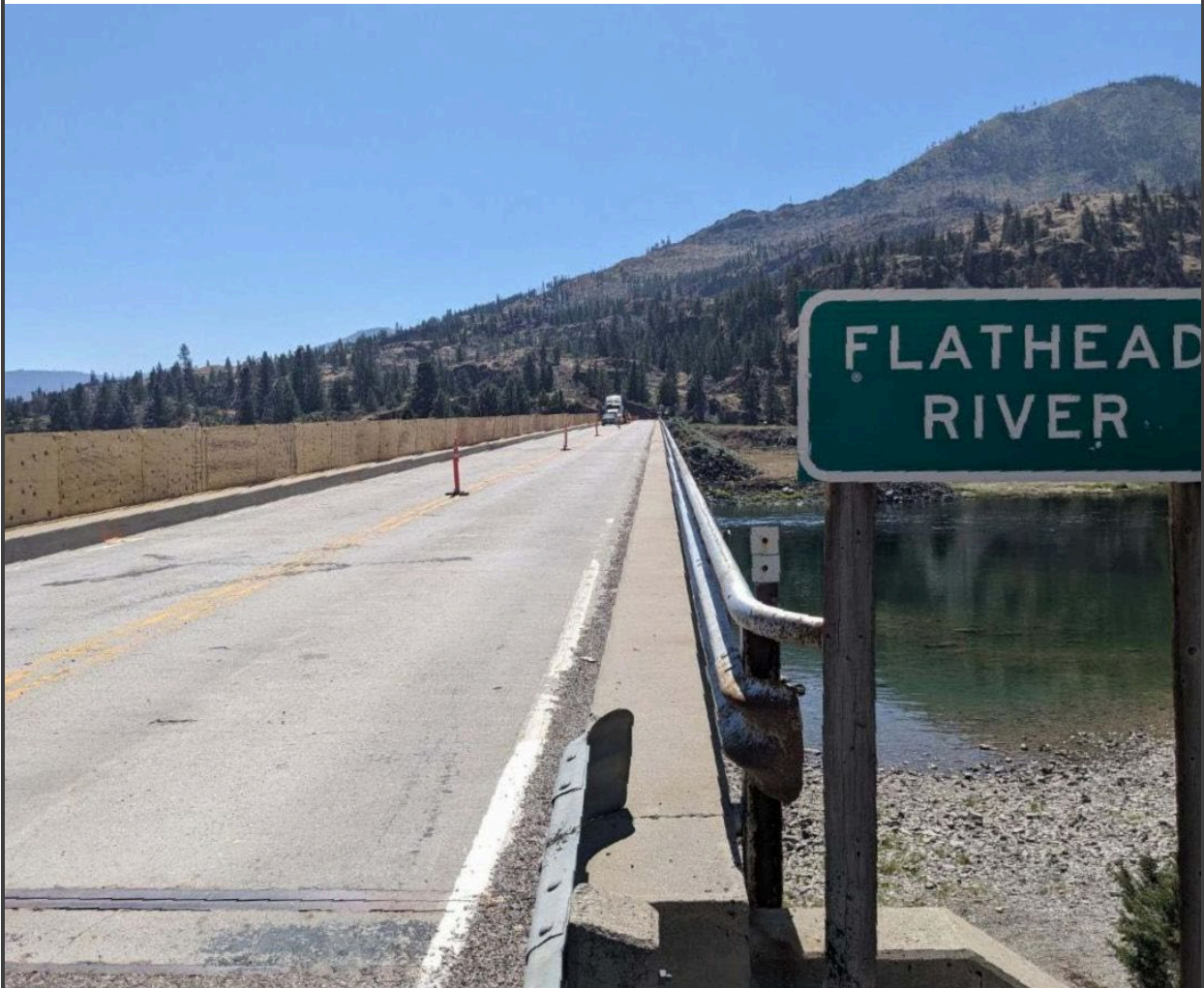
Flathead River - Perma Bridge